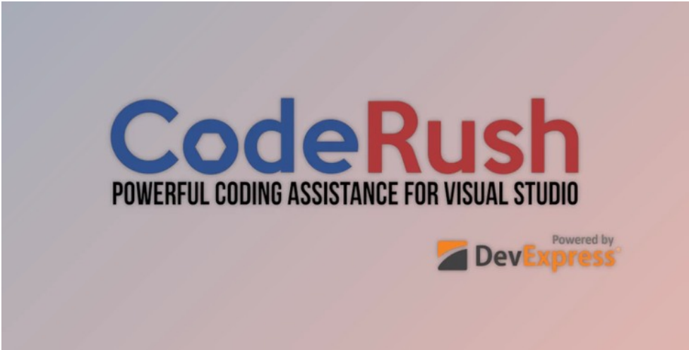
DevExpress CodeRush v25.13 (02 Jul 2025) + Patcher